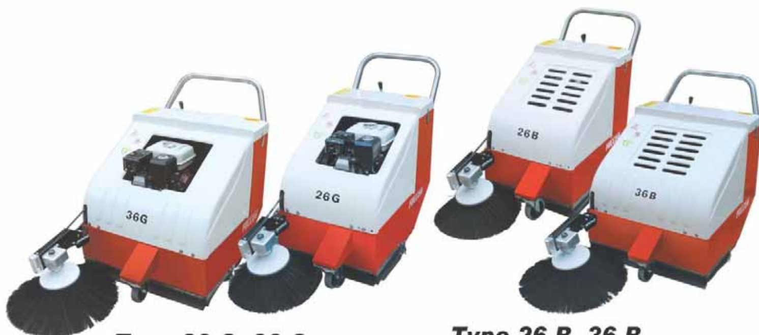
Type 26-G, 36-G (Petrol engine)